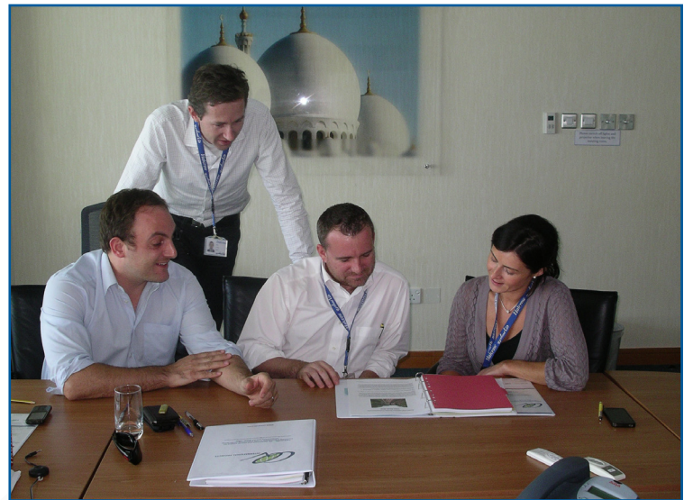
A Discussion Group at the Halcrow-hosted Assessor Training Course in Abu Dhabi in October 2011.

Further infrastructure developments in the Gulf States Region are being considered for assessment using CEEQUAL for International Projects.